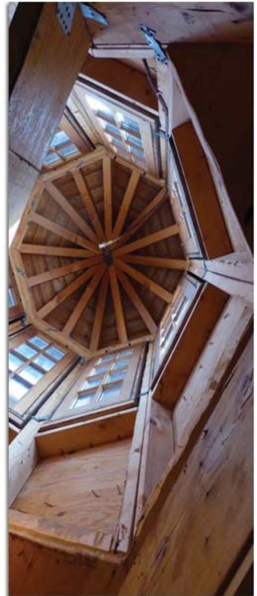
↑ Wood-framed cupola at a mansion class residence Milwaukee area, Wisconsin

To view project profiles for some of our representative projects, visit www.btcp.com/projects .