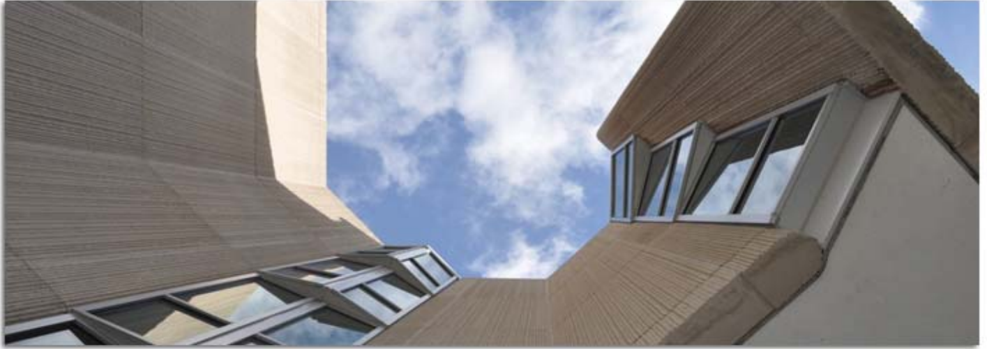
↑ The Hogan Building, Northwestern University, Evanston, Illinois