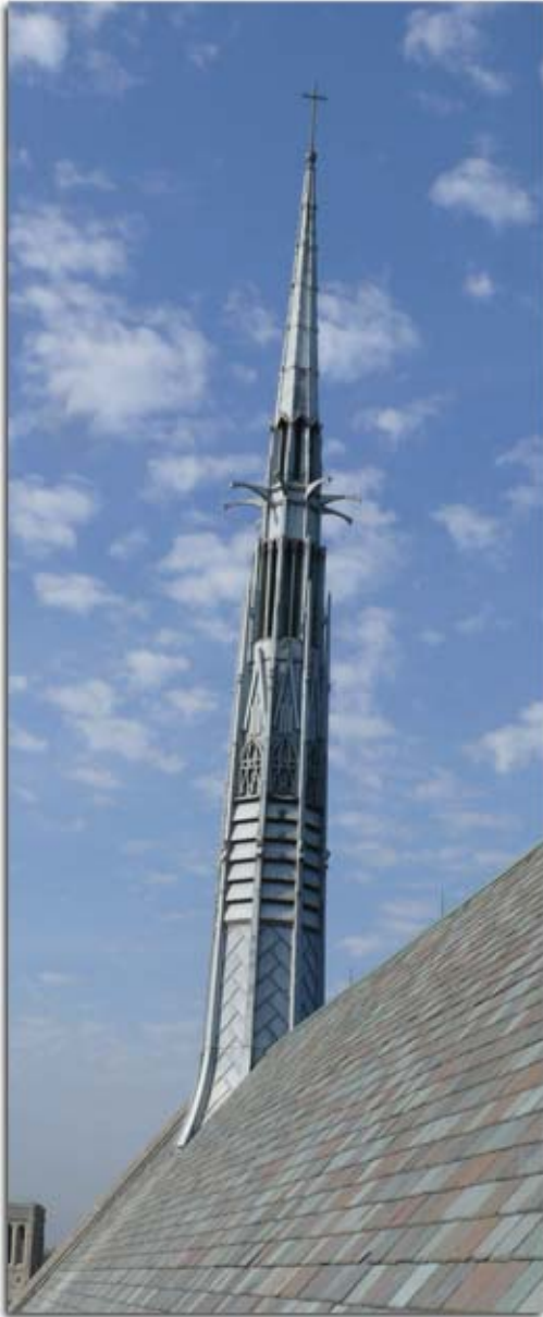
↑ Millar Chapel, Northwestern University Evanston, Illinois