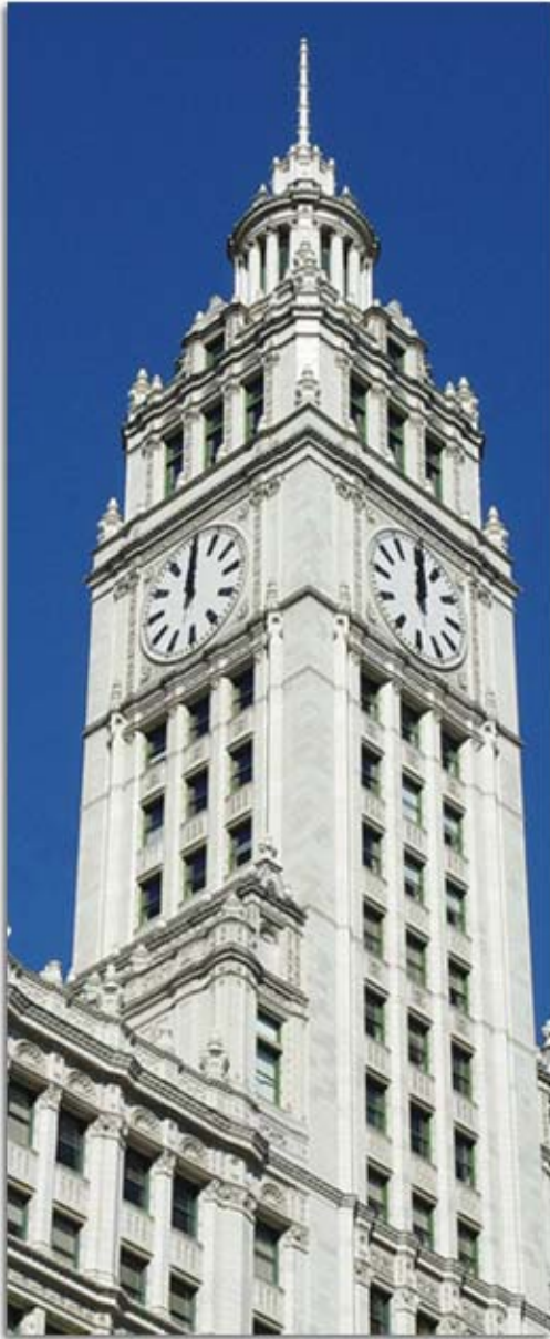
↑ Wrigley Building Clock Tower Chicago, Illinois