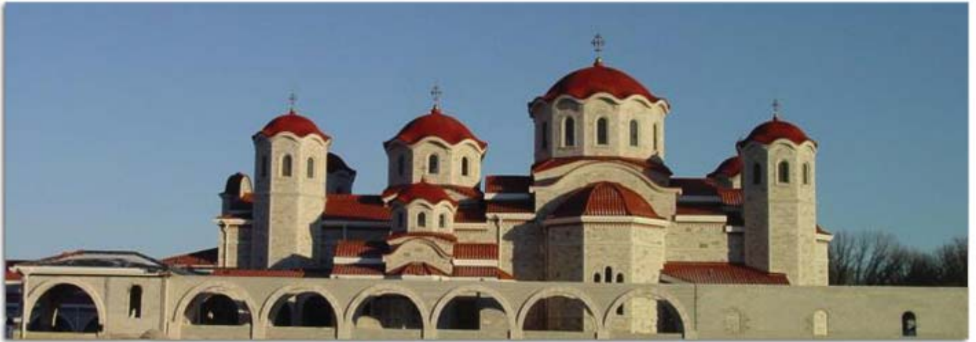
↑ St. John Chrysostomos Greek Orthodox Monastery, Pleasant Prairie, Wisconsin